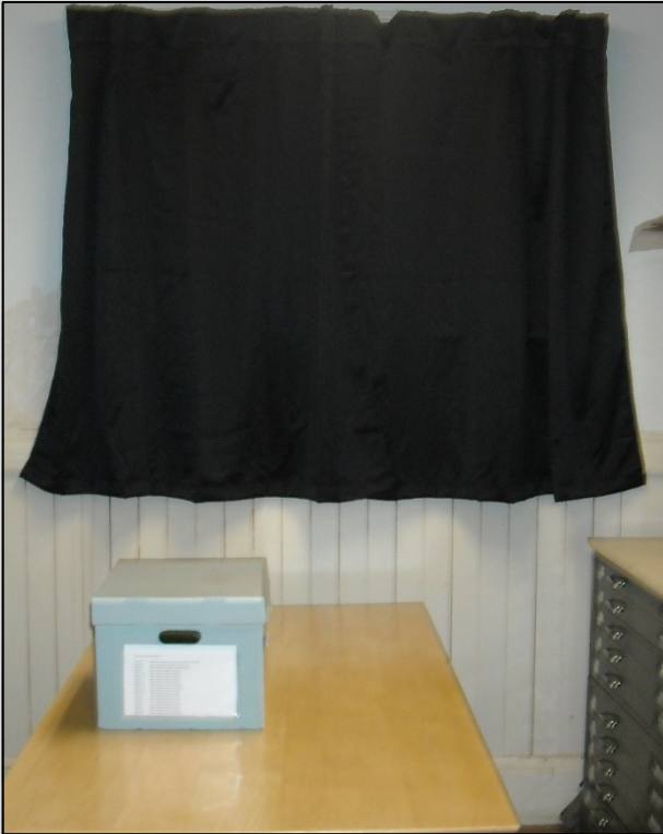
10 Blackout Curtains Block Degrading Sunlight in the Basement Storage