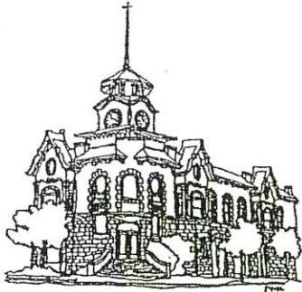
Old Gilroy City Hall - 1905