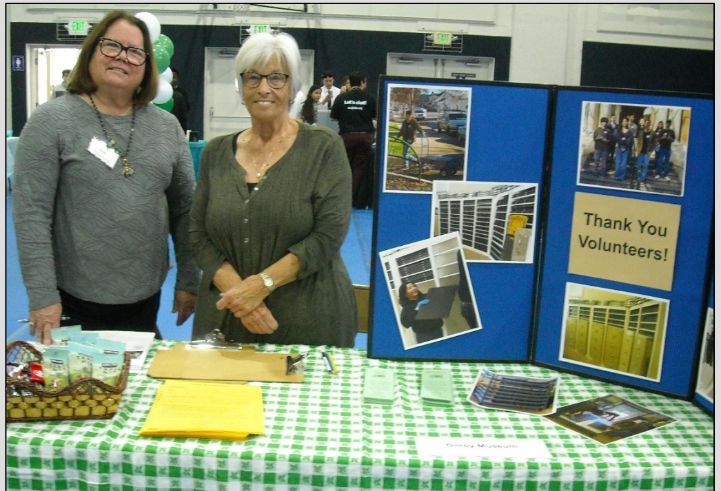
Volunteers at the OpportuniTEEN Fair