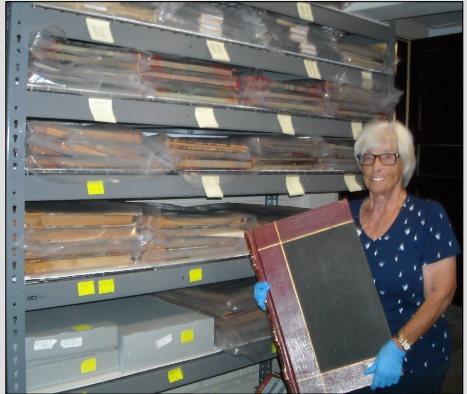
53 Gilroy City Tax Ledgers Moved to Metal Storage Racks & Protectively Bagged